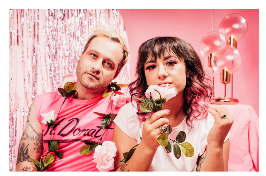
Link to High-Res Photo HERE

"... an almost riot girl tone, but also very reminiscent of someone like Juliette Lewis and The Licks. It's a heavy song and powerful, with blistering guitar work and motorik drum fills..." - Northern Transmissions