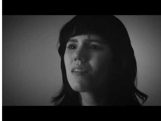
[Screenshot from video]