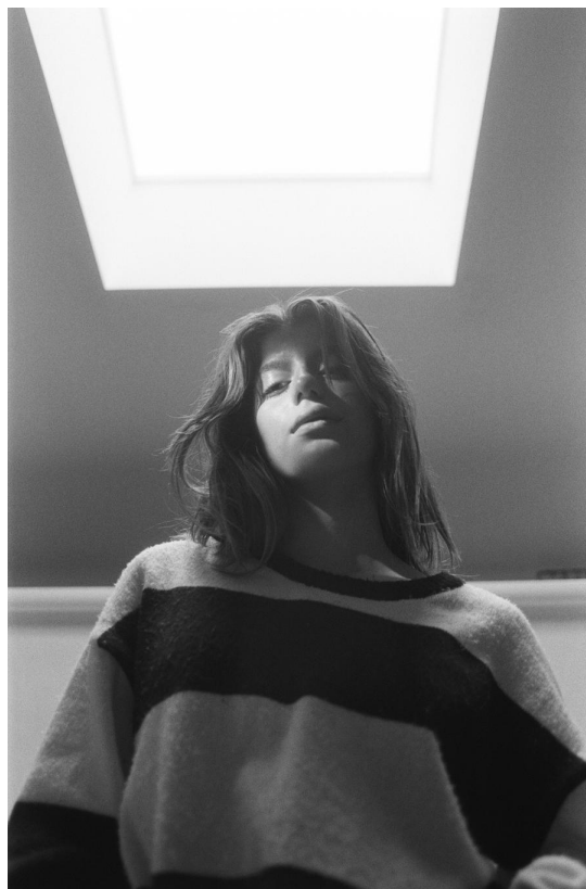
Download the press photo HERE

Aug 18 - Riverfest Elora - Centre Wellington, ON - Tickets HERE