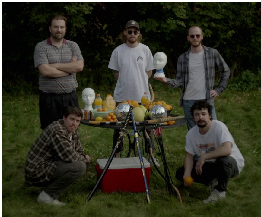
Screenshot from “Tangerine” Music Video

With II: Left Behind garnering attention from Exclaim! Magazine , and radio play from CBC and 102.1 The Edge ; this upcoming follow up is bound to make an even bigger splash. Often praised for tight, high energy live performances, the band has a rare and passionate on-stage chemistry. Excuse Me. have shared the stage with the likes of Alessia Cara and The Strumbellas at Riverfest 2022, Canadian supergroup TUNS , and Snotty Nose Rez Kids . They have also amassed an impressive online following, with 2.3 million views on TikTok alone.