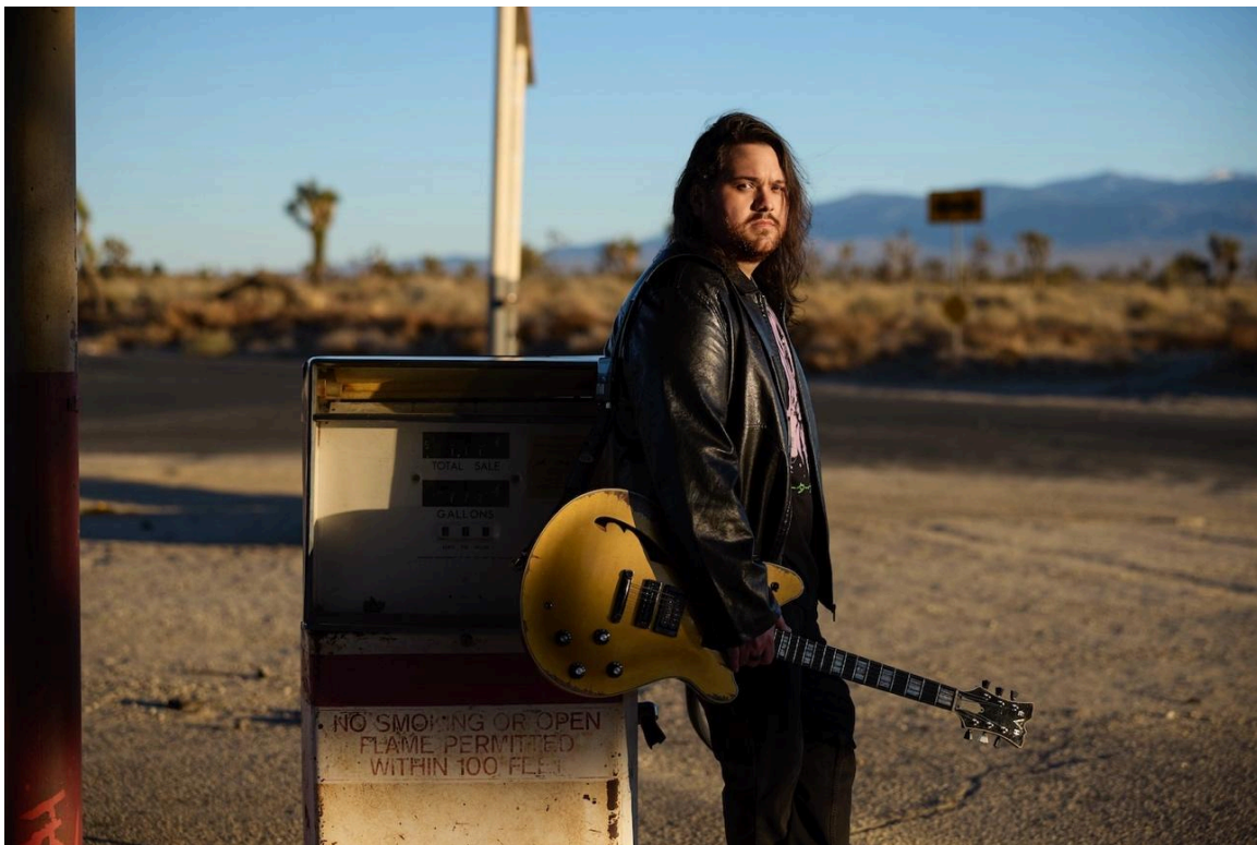
Wolfgang Van Halen

Aug 09 – Mountain View, CA – Shoreline Amphitheatre * Aug 10 – Stateline, NV – Lake Tahoe Outdoor Arena at Harveys * Aug 13 – Ridgefield, WA – RV Inn Style Resorts Amphitheater * Aug 14 – Auburn, WA – White River Amphitheatre * Aug 16 – Vancouver, BC – Rogers Arena [Sold Out] * Aug 19 – Edmonton, AB – Rogers Place [Sold Out] * Aug 20 – Calgary, AB – Scotiabank Saddledome [Sold Out] * Aug 23 – Mount Pleasant, MI – Soaring Eagle Casino * Aug 24 – Cincinnati, OH – Heritage Bank Center * Aug 27 – Providence, RI – Amica Mutual Pavilion * Aug 28 – Manchester, NH – SNHU Arena * Aug 30 – Halifax, NS – Citadel Hill * * Opening for CREED