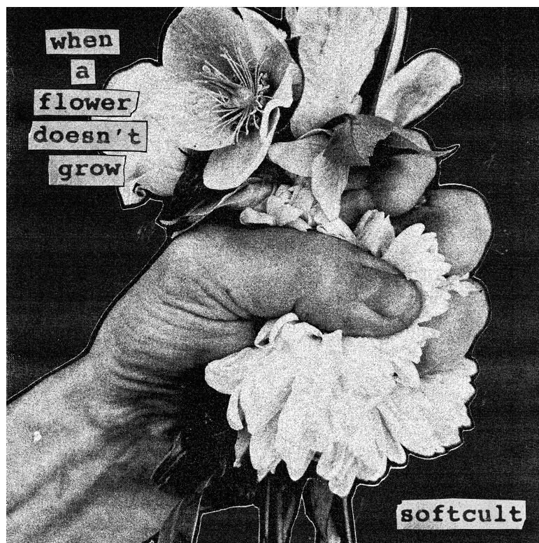
When A Flower Doesn't Grow Artwork | Download HERE